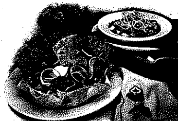
Fajita Salad & Tortilla Soup

Ask your server. Small...3.69 Large...5.49